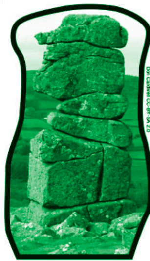
Don Chalmers CC-BY-SA 4.0