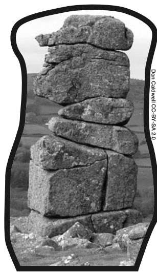
Don Caldwell CC-BY-SA 2.0