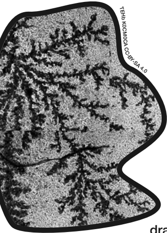
TEHB KROCHMOCA CC-BY-SA 4.0

We want you to use your imagination to make a competition entry that can be about anything at all to do with geology.